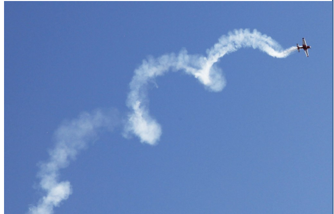
Pete Ferguson, Fallon MT

As an experiment, food service was minimized